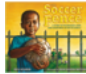
The Soccer Fence