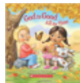
God is Good All the Time