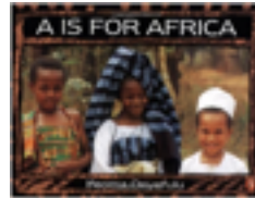
A is for Africa