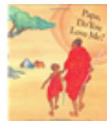
Papa, Do You Love Me?