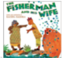
The Fisherman and His Wife by Rachel Isadora