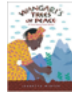
Wangari's Trees of Peace by Jeanette Winter